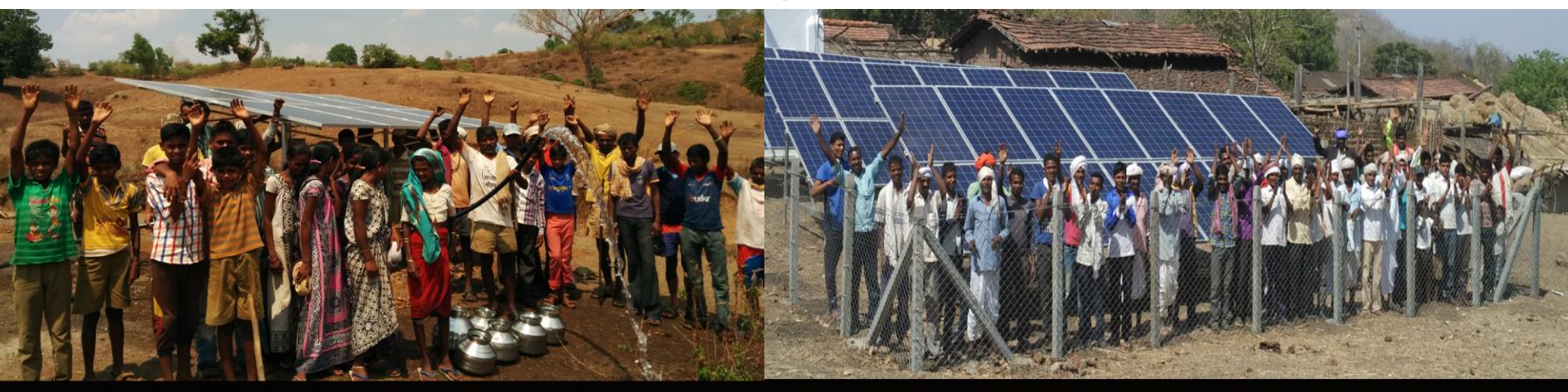
Solar PV Microgrid - Ghodichapada, Maharashtra, 2015