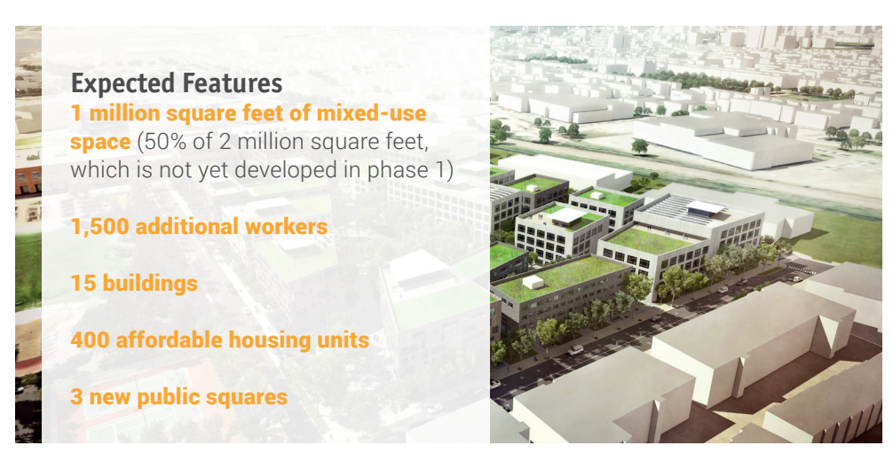
Future of Technopole Angus Pahse II